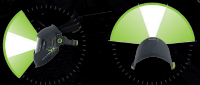
Comparing fields of view: standard ADF vs. optrel panoramaxx